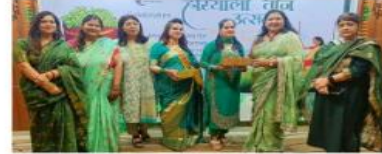
जी एन आई ओ टी इंस्टीट्यूट ऑफ प्रोफेशनल स्टडीज में तीज उत्सव का आयोजन।