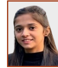
Kamini Company : Air India