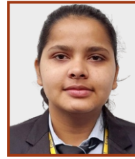
Ashi Company : Insurance Dekho